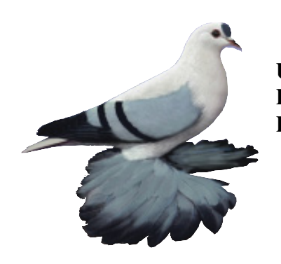
United Swallow Club P.O. Box 152 Patagonia, AZ 85624