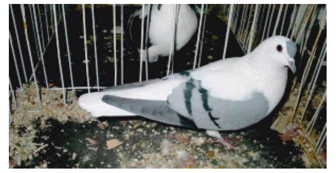
Blue Black Barred Thuringer