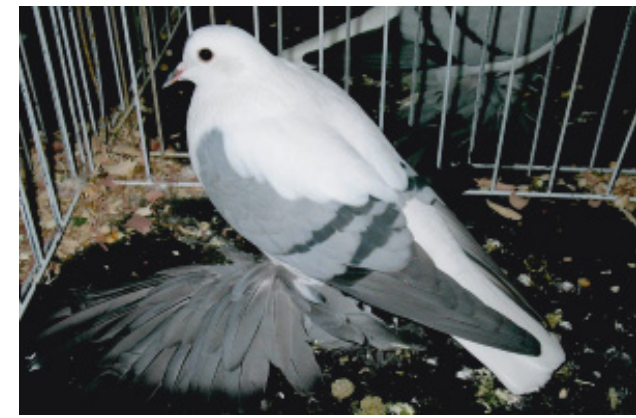
Blue Black Barred Silesian: Bill Griebel Jr.