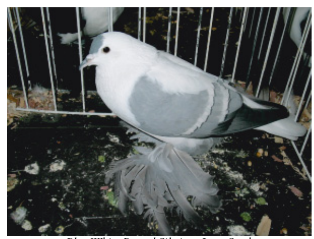
Blue White Barred Silesian: Leon Stephens