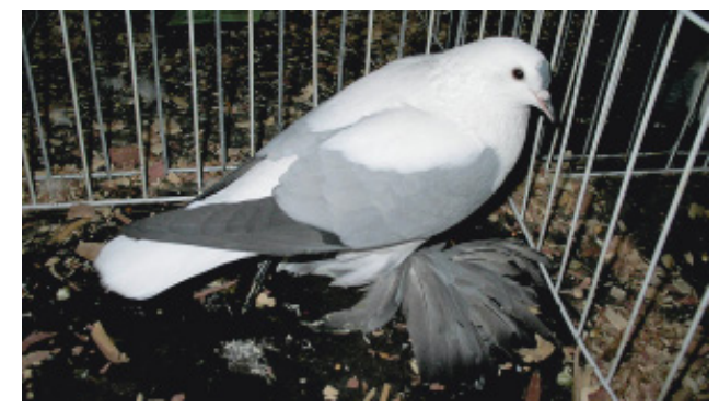
Blue Barless Silesian